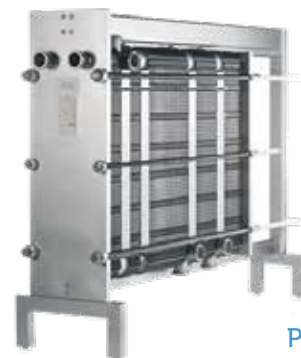
Plate Heat Exchanger

We are an Alfa Laval Master Distributor and offer a full line of PHEs including gasketed and brazed models. We also offer Alfa Laval's ConTherm® scraped surface heat exchangers.