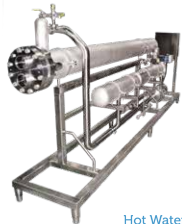
Hot Water Set