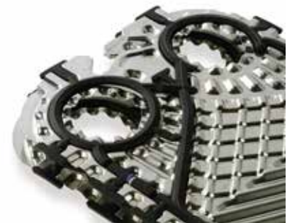
Heat Exchanger Service and Parts