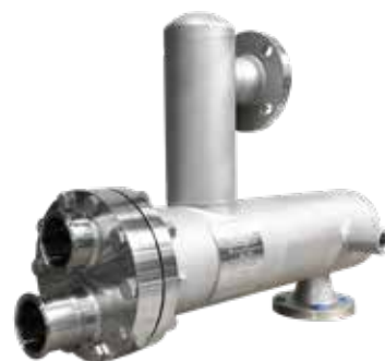
Shell & Tube Heat Exchanger

Our custom-built spiral heat exchangers are designed to meet your exact needs. Alfa Laval models also available.