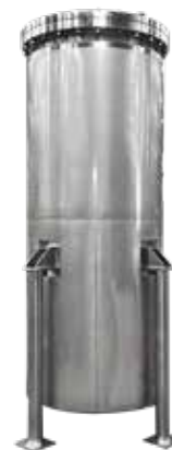
Spiral Heat Exchanger