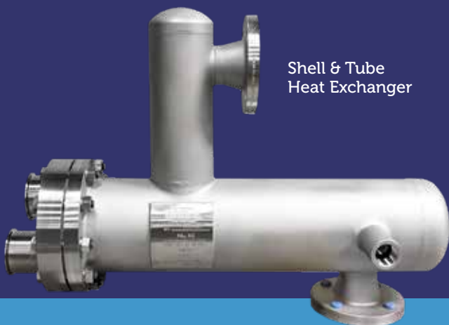
Shell & Tube Heat Exchanger